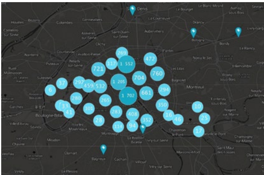
Figure 1 – Cinematography in Paris (by postcode)

Film-making plays a significant role in the cultural and creative clusters of Paris. The city has a rich history in the film industry and has been a popular location for filmmakers from around the world. The presence of cultural and creative clusters in Paris, such as production companies, studios, film schools, and related industries, contributes to the city's vibrant film-making scene. For this study, the focus is on the digital archive of films shot on location in Paris, France, between the years 2016 and 2021 (see Figure 1). The archive provides valuable information about the film production company, the director, the specific location within the city (captured accurately through the postcode), and the duration of the filmmaking process.