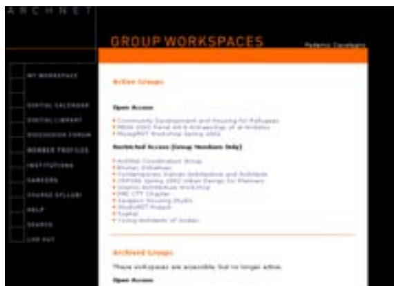
Fig. 2 - Home page of Archnet, web based on-line collaborative platform

With these assumption in mind, the fundamental point in designing remote collaborative learning environments is the study of online spaces and communication dynamics that support and favor the creation of a common memory, allowing the members of the community to play an active role in its creation. Memory, does not emerge from a simple fruition and a mere access of impersonal information, yet it takes place through the active construction of information and knowledge created by community members themselves. People who are involved in collaborative workshops have to create their own common memory to have the feeling of "inhabiting" a space and belonging to the community. Edgar Morin (1977) underline that the environment is not only co-present for individuals, but it is also co-organizer. People and environment constitute an eco-dependant system that is mutually influenced. Enabling people to build their own environment, be it real or virtual, strengthens their feeling of belonging to a community. On this aspect, Martin Heidegger (1955) reminds us that