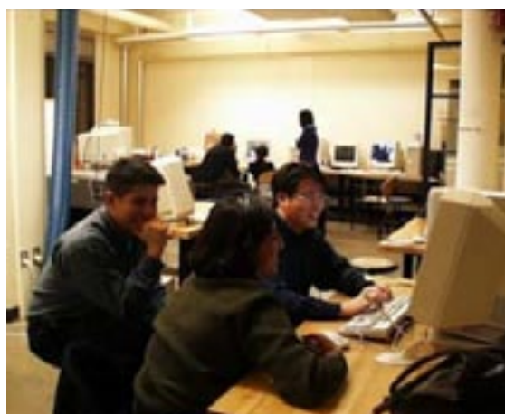
Fig. 8 - Media space during team-to-team work