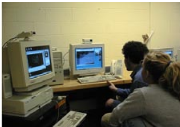
Fig. 3 - Students interacting and exchanging file via video-conferencing

Secondly, we do not consider media as neutral. Media mediate communication. For that, we should take into consideration that every communication system has its peculiar features that can enhance certain elements of interpersonal communication presenting advantages or disadvantages. "Technology is therefore no mere means. Technology is a way of revealing. [...] Thus what is decisive in techne does not lie at all in making and manipulating nor in the using of means, but rather in aforementioned revealing.