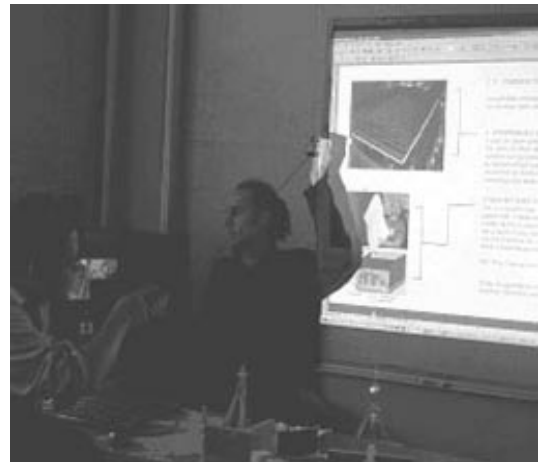
Fig. 1 - Using digital camera to indicate contents during remote interaction

of it. Even if this might sound rhetorical, it is necessary to stress that when designing collaboration environments, this element is not always taken into consideration.