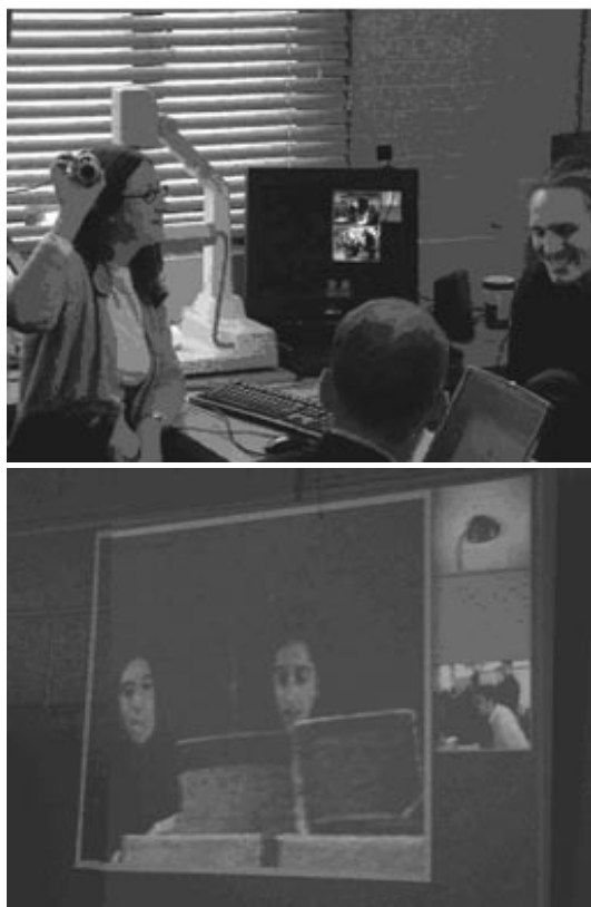
Fig. 5 and 6 - using the video during the remote collaboration

We can also observe that during the workshop, MIT students were allowed to eat and drink: if this can be seen in the US as a way of establishing an informal atmosphere, it is in contrast with the Japanese teammates, who think it is inappropriate to eat at their workplace, and it marked the cultural and behavioral differences between the two groups.