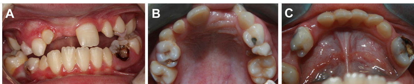
Fig. 2. (A) Frontal view of occlusion shows poor oral health, with many carious lesions and gingivitis, particularly in the region of the maxillary right lateral incisor, and large amount of dental plaque. (B) Occlusion view of the maxilla shows several caries and absence of many teeth. (C) Occlusion view of the mandible shows several caries and absence of many teeth.

The only dental procedure carried out was the extraction of a primary tooth under local anesthesia. The oral exam revealed no soft tissue lesions, but there is presence of carious lesions in several teeth, gingivitis, bilateral crossbite and anterior open bite. Several teeth were absent and many primary teeth were present, along with the deformed anatomy of tooth 16 (Fig. 2A, B and C). Panoramic radiography (Fig. 3A) showed impacted teeth, microdontia and agenesis of several teeth. Lateral telerradiography (Fig. 3B) showed the impacted maxillary right central incisor, with accentuated root curvature and counter-clockwise rotation of the crown, open gonial angle and absence of a defined occlusal plane. Dental treatment addressed the patient's aesthetic and functional needs, which significantly contributed to improving his quality of life.