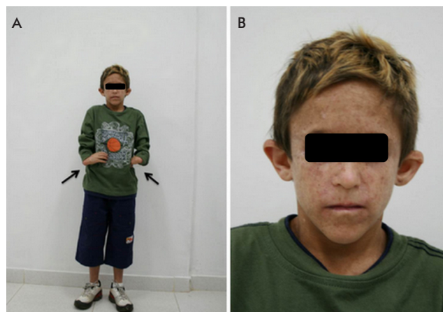
Fig. 1. (A) Photographs of the entire body of the patient, showing malformation of his right hand, absence of his left hand (arrows), short stature and low weight for his age. (B) Close-up of the patient's face, showing the characteristic skin pigmentation of FA patients.

The physical exam showed that the patient was short and underweight for his age, with congenital malformations of his arms and skin pigmentation. The patient's appearance was roughly that of a 12-year-old child (Fig. 1A and B).