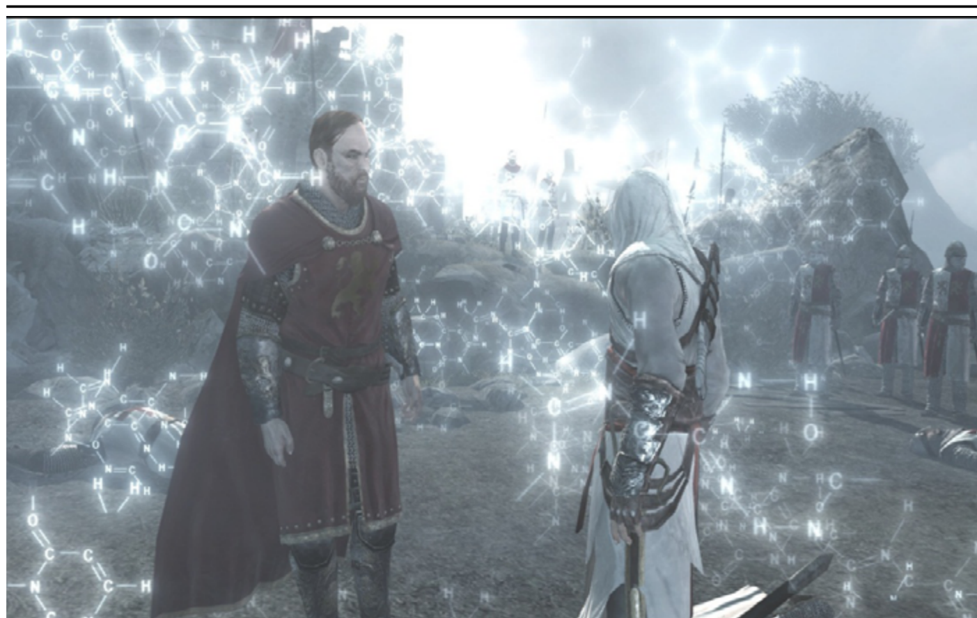
Figure 3: “Re-membering” Altair - The genetic construction of Altair’s memory and the memorial construction of his identity go hand in hand in Assassin’s Creed . This phenomenon is evident only when the memory is desynchronised and dismembered in the game.

finer measure that it is patient of the real action of surrounding images, the other in which all change for a single image, and in the varying measure that they reflect the eventual action of this privileged image? (Bergson, 1911, p. 13).