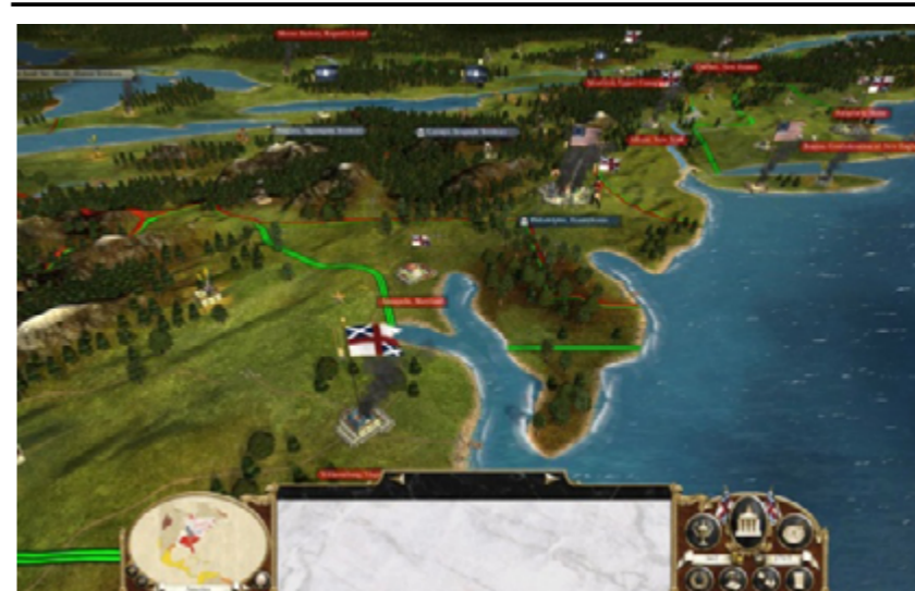
Figure 2: Screenshot from Empire: Total War that accompanies DeGeen’s journal entry.

The range of ways in which in-game memories can coexist in videogames indicates a multiplicity that is indeed hard to describe. Further, there are overlaps between the in-game memories and the real-life memories of the player as quite often one influences the