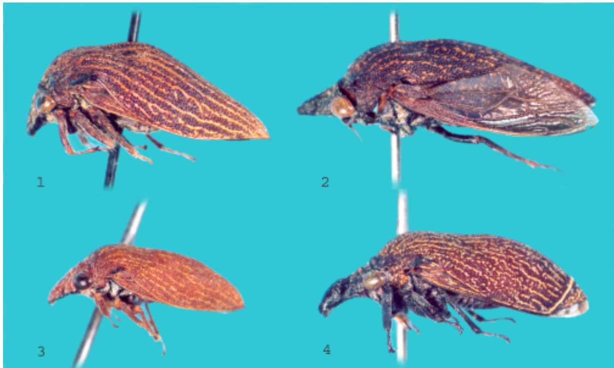
Figs. 1-4. Nasuconia gen. nov., lateral view: 1 - N. lineosa (Walker, 1862); 2 - N. catarina sp. nov. (holotype); 3 - N. nanica sp. nov. (holotype); 4 - N. curculionoida sp. nov. (holotype).