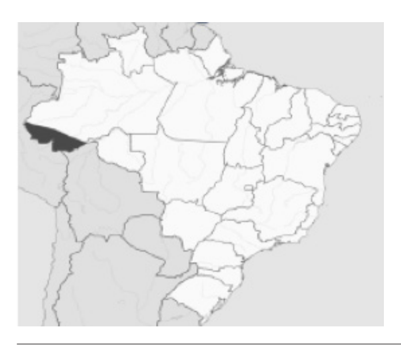
Figure 1. Acre State. Retrieved 10 May 2017 through CreativeCommons.org, non-profit organization devoted to expanding source range for legal share & search. Available at: <a href="https://upload.wikimedia.org/wikipedia/commons/thumb/8/84/Acre_in_Brazil.svg/2008px-Acre">https://upload.wikimedia.org/wikipedia/commons/thumb/8/84/Acre_in_Brazil.svg/2008px-Acre</a> in Brazil.svg.png>.

Most Brazilians cannot locate the state of Acre in the map (Figure 1). Forest-dependent, Acre borders the countries of Peru and Bolivia with Spanish as their predominant language in school. Acre's identity is a mixture of traditional and indigenous cultures. In order to attend the need of its riverside residents who would drop out of school in fear of facing flood, wild animal and other dangers, the state of Acre created Asas da Florestania (The Forest-based Wings Program). In fact, the term Florestania is a combination of the words forest ( floresta ) and citizenship ( cidadania ) in Portuguese, as in "forest-based citizenship". From its very beginning, this neologism proposes the tone of Asas program: highly engaging and representative of its student population.