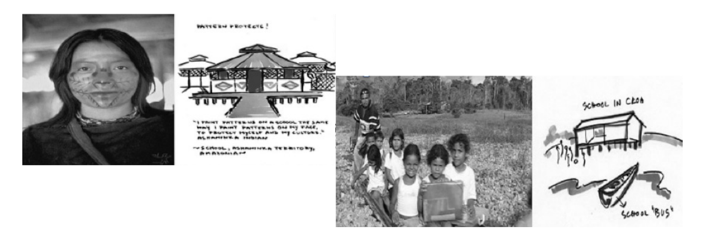
Figure 2. Left: Ashanika Indian, Acre. Photo by Mauro Almeida. Courtesy the artist and Galerie Nordenhake, Berlin. Right: School Bus, Croa Community, Acre. Courtesy the artist and Max Protetch Gallery, New York. Marjetica Potrč, drawing for project The Struggle for Spatial Justice (A luta por justica espacial) for 27ª Bienal de São Paulo. Retrieved 10 May 2017 through Creative Commons.org, non-profit organization devoted to expanding source range for legal share & search. Available at: <a href="https://umaincertaantropologia">https://umaincertaantropologia</a>. org/tag/participatividade/>.

For that reason, the purpose of this study is to scrutinize Asinhas' setting by juxtaposing the project's infrastructure of Educational Agents, forest-based content, and home visits with the Continua of Biliteracy by Hornberger (1989) and its visitation by Hornberger & Skilton-Sylvester (2000) to see how the Acre an biliterate and multilingual settings are acknowledged at an extent that favors the child's whole development through planned content and methodology. In light of that, the overarching question is: to which extent are all identities and languages represented in terms of bilingualism, teaching practices, and resource at this particular riverside indigenous 'forest-based citizenship' program? The languages and the cultures that are at play are also pinned as current due to the hybrid status quo of the program's population sample (Figure 2). This setting is in constant reconfiguration. Passersby go up the marginal routes of the Amazon River, where biliteracies include native fauna and flora expertise, rubber extraction and political jargon, and asylum agenda knowledge.