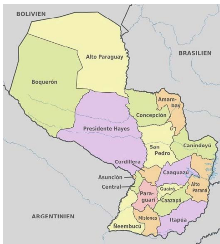
Figure 1 – Political and Health Division of Paraguay (40).

The study was descriptive, with an analytical, cross-sectional and temporally retrospective component. The geographical area considered for this study was the 18 departments of Paraguay, (including the capital, Asuncion), which corresponds to the political division of the country and which also corresponds to the health divisions ( Figure 1 ). The time frame considered was from March 7 (the date of the first case diagnosed in the country) until September, 30, since the quarantine facilities stopped working at the end of September approximately (1, 2, 3).