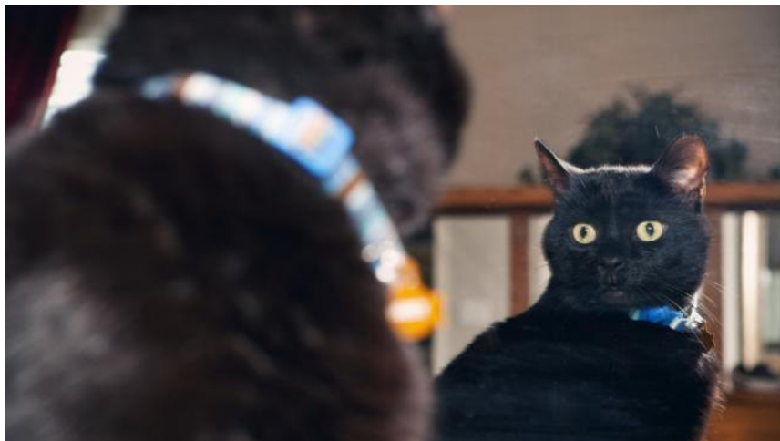
Figure 1 – The broken mirror