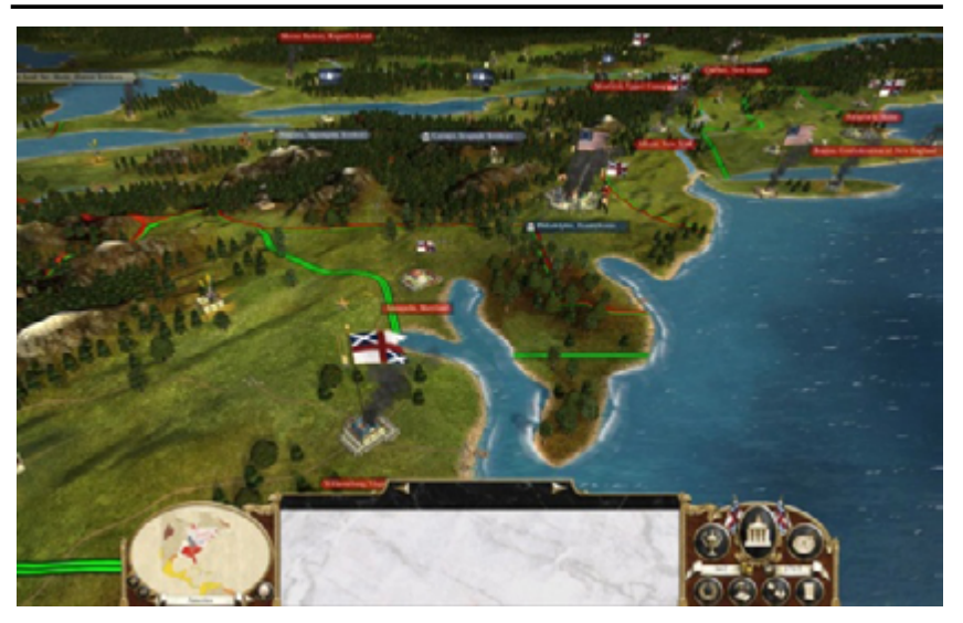
Figure 2: Screenshot from Empire: Total War that accompanies DeGeen's journal entry.

The range of ways in which in-game memories can coexist in videogames indicates a multiplicity that is indeed hard to describe. Further, there are overlaps between the in-game memories and the real-life memories of the player as quite often one influences the