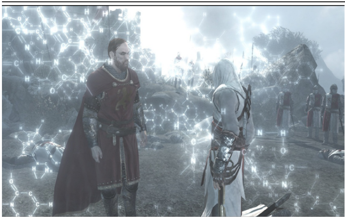
Figure 3: "Re-membering" Altair - The genetic construction of Altair's memory and the memorial construction of his identity go hand in hand in Assassin's Creed . This phenomenon is evident only when the memory is desynchronised and dismembered in the game.