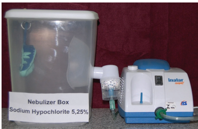
Fig. 2. Nebulizer box used for the disinfection treatment with steam.

SP, Brasil), was applied for 10 min (19). After the disinfection period, the impressions were rinsed in distilled water for 15 s to remove the impregnated hypochlorite (10).