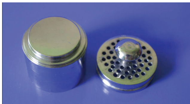
Fig. 3. Platform and tray for impression used to fabricate the specimens for the surface roughness test.

The sample consisted of 18 type III and 18 type IV gypsum plates, obtained from irreversible hydrocolloid impressions of a standard polished stainless steel platform. A cylindrical polished stainless steel platform (2.8 cm diameter) was used as standard, and a stainless steel tray was made on top of this (Arte Nacnaya Ltda. São Paulo, SP, Brazil) with internal space of 5 mm and with perforations in its body for IH retention. Space was not left at the base of the platform, leaving this area in contact with the tray, to serve as a stopping point (Fig. 3).