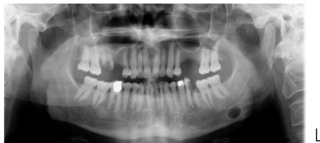
Fig. 1. Panoramic image.

A CT scan was performed with the multislice CT Toshiba® Aquilion S16 (ToshibaEurope Medical System) (sixteen 1 mm-thick slices), at the S. Teotónio Hospital (Viseu, Portugal), to study the dimensions, nature, and relation of the entity with anatomical structures (Fig. 2). A 3D rendering of the mandible was accomplished by using the software eFilm Workstation v.2.1.2® (MERGE Healthcare, Nuenen, Netherlands) (Fig. 3).