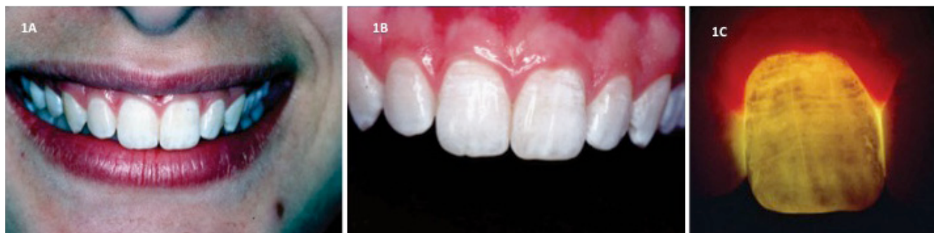
Figure 1. Initial aspect of mild dental fluorosis stains: 1A - smile view; 1B - approximate view; 1C - dental trans illumination showing diffused opacities on enamel.

Based on anamnesis and clinical examination, the diagnosis of the cause of the white enamel stains was dental fluorosis. Dean's Fluorosis Index ( Table 1 ) [13] was used to classify the spots as mild fluorosis and enamel microabrasion was recommended. The patient and legal guardians were informed of the advantages and limitations of this technique, and then the following clinical procedures were conducted.