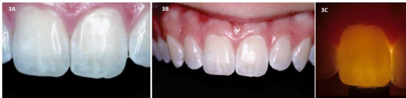
Figure 3. Final clinical appearance after treatment: (3A) and (3B) immediate results; (3C) dental trans illumination after treatment shows the disappearance of the enamel opacities.