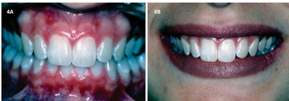
Figure 4. Clinical aspect after one-year follow-up: 4A - approximate view; 4B - smile view.