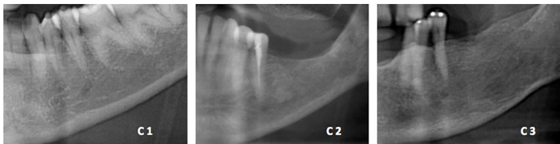
Figure 2. Example of radiographs showed to the participants aiming the orientations about the MCI

Secondly, the participants received examples of MCI classification and were able to discuss among themselves the particular impressions and conclusions of each radiograph. In Figure 2 , examples of images used in the discussion are shown. Sequentially, they applied the MCI to evaluate the mandibular endosteal margin of 150 PRs.