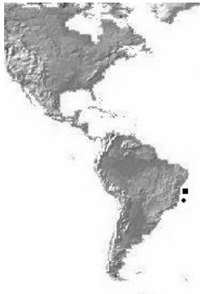
Figura 4. Distribution of Scyllarus ramosae . The previously known distribution show by circles and the present distribution by squares.