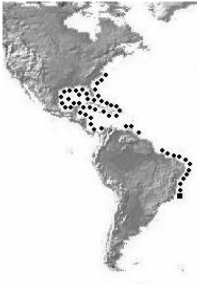
Figura 3. Distribution of Scyllarus chacei . The previously known distribution show by circles and the present distribution by squares.