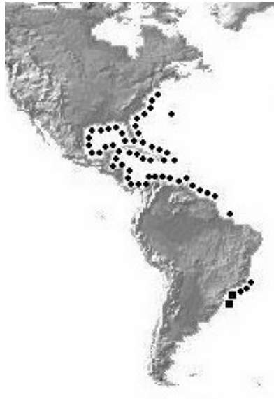
Figura 5. Distribution of Nephropsis aculeata . The previously known distribution show by circles and the present distribution by squares.