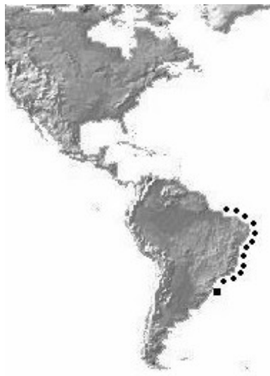
Figura 2. Distribution of Scyllarides brasiliensis . The previously known distribution show by circles and the present distribution by squares.