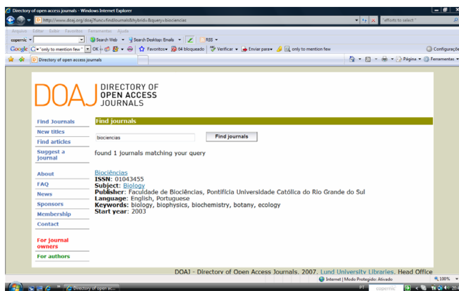
Figure 2. Page of DOAJ showing information about the journal Biociências.

In this first issue entirely online we have a wide spectrum of articles describing themes from zoology to microbiology. We have an article describing new information about recent described species of snake and also about the toxicological effects of the seed extracts from Abere. Abere is a Yoruba name for Hunteria umbellata seed. This plant grows well in West Africa and it belongs to the family Apocynaceae. We have also a scientific article describing the histological characteristics and composition of the closer muscle fibers of Cyrtograpsus angulatus , only to mention few. A total of 13 full research papers and 2 scientific notes, besides this editorial make up the present edition. Several scientific topics are present in this issue, which is a tradition of Biociências, since its first issue 15 years ago.