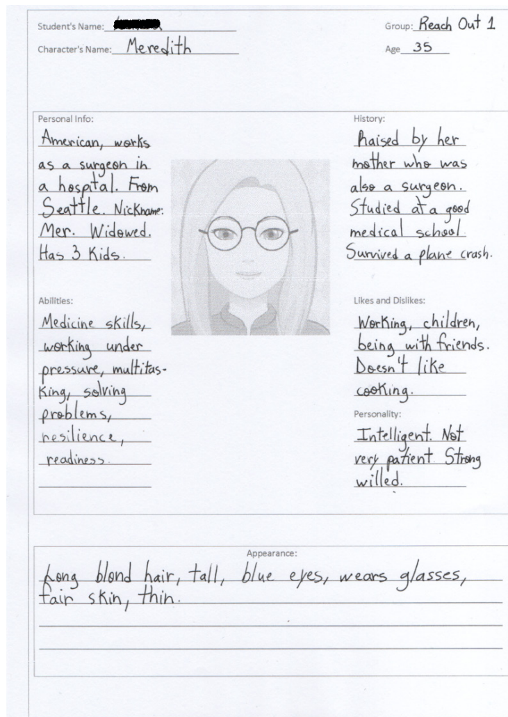
Figure 2. Student's character sheet

sheet. In this part, the number of points spent to create the character is also presented. Standard characters in a GURPS game are normally created with 100 points, but the GM may define a different standard in order to make the campaigns more challenging. On the left part, players should write their character's basic attributes (strength, dexterity, intelligence, and health) as well as their innate abilities, limitations, and quirks. The numbers preceding the characteristics in these sections refer to the amount of points a player spent to acquire them. Other features in this part of the sheet include the character's speed, the amount of weight they are capable of carrying, and also battle-related features that are used in situations of physical confrontation. Players use the right part of the sheet almost exclusively to write their character's skills as well as the amount of points paid for each skill and the level of ability the character has in each of them (higher levels indicate higher proficiency, and vice versa.) The character's avatar and its belongings are located in the central part of the sheet. The sheet learners used in the project is presented in Figure 2 . It was adapted from the GURPS sheet and it was simplified as to allow learners to make game decisions without having to worry about the wide variety of options available in the original system.