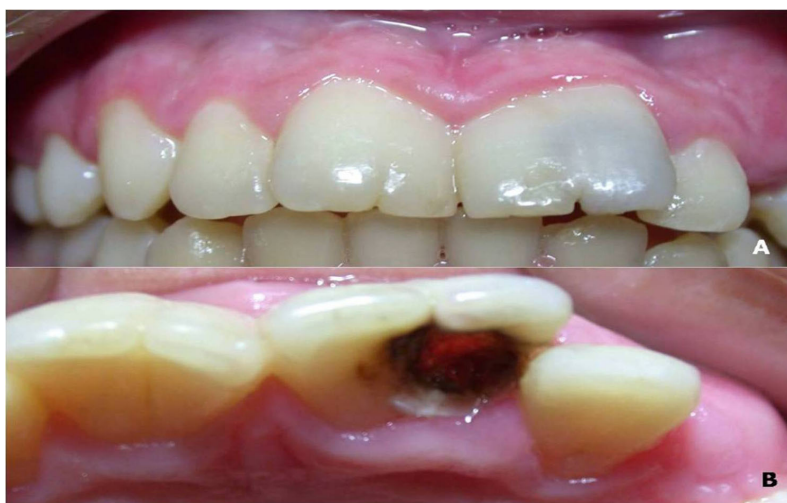
Fig. 3. A) Vestibular view of 11 and 21 large clinical crown. B) Lingual view.

Tooth fusion and gemination are two different anomalies of formation, characterized by the formation of a tooth with a wide clinical crown. Fusion is the union of two dental germs, which may occur at the level of enamel or dentin, depending