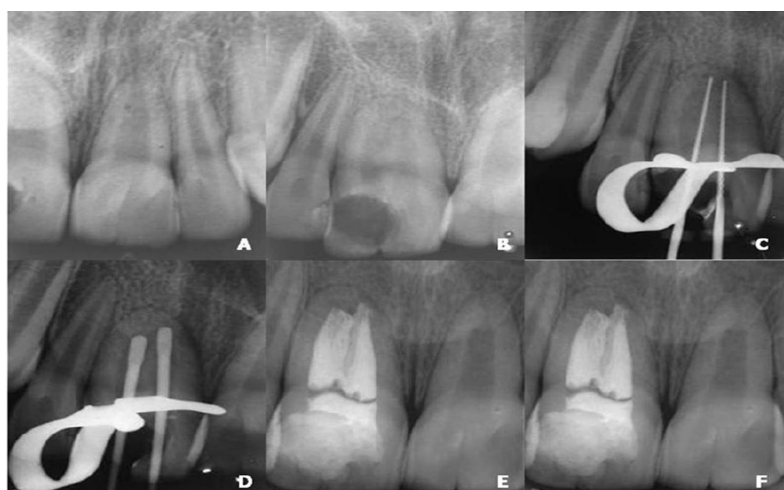
Fig. 4. A) Radiograph showing the extensive pulp chamber of element 21. B) Radiograph showing fusion between the element 11 and a supernumerary tooth, resulting in an element with an extensive pulp chamber and presence of two root canals. C) Radiograph showing the determination of working length. D) Radiograph of cone proof with an inverted-cone. E) Radiograph of final obturation. F) Radiograph of the 5-year follow-up.