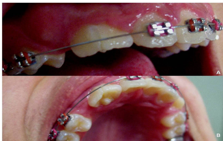
Fig. 1. Clinical view. A) Vestibular view of fused crown of tooth 12 and 13. B) Lingual view.

based cement with gutta-percha (Dentsply Maillefer, Ballaigues, Switzerland) by Tagger's hybrid technique (Fig. 2 B). The coronal access was sealed with zinc phosphate cement. Unfortunately, the patient did not return for the tooth restoration and follow-up.