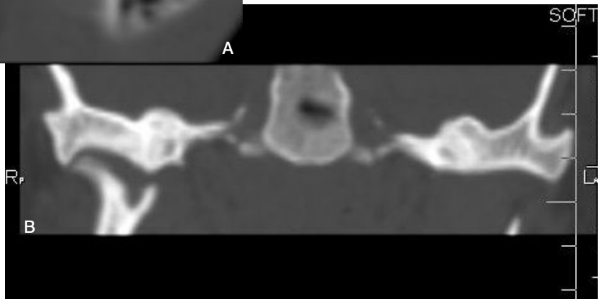
Figure 3A-B. Sagittal and coronal CT slices revealed a bony proliferation with benign signs arising from the antero-medial side of the sigmoid notch causing alterations on the articular eminence, condilar morphology and periarticular soft tissue calcifications.