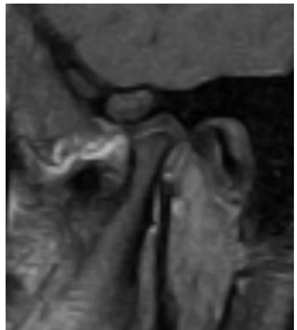
Figure 5. Magnetic Resonance confirmed the findings of the CT and revealed alterations of the disc morphology.