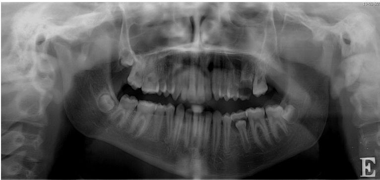
Figure 2. Panoramic radiography showed an exophytic radiopaque mass arising from the sigmoid notch on the right side and altered condilar morphology