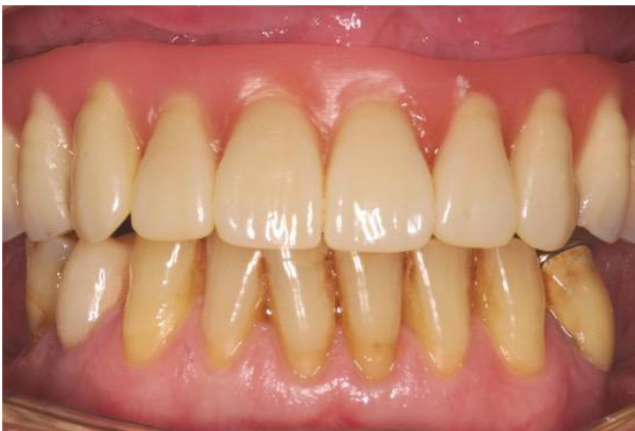
Figure 1. Delivery of the maxillary implant-supported fixed complete denture.

A 77-year-old male patient was treated at the university dental clinic following standard clinical and laboratory procedures, in accordance with the decision-making criteria to restore the edentulous maxilla [10] with an IFCD ( Fig. 1 ). In the mandible, the patient had natural teeth up to the premolars with no use of partial dentures to replace the missing molars due to financial constraints. The patient voluntarily signed an informed consent form to participate in a cohort study on IFCD survival, which was approved by the