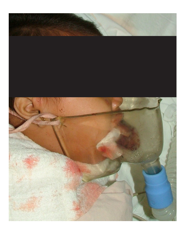
Fig. 4. Patient lateral view. The patient was placed in a supine lateral position with a facial oxygen mask. In this position, she was relatively comfortable and kept a stable oxygen saturation of 98%.

The child was kept supine in an inclined position, a condition that allowed a more comfortable breathing and had an oxygen saturation of 98% with the oxygen mask (Fig. 4). The child showed no episodes of major bleeding in the period when she was hospitalized, and after blood transfusion there was an improvement in the anemia (hematocrit of 30.5%) and hemoglobin concentration (9.1 g/dL).