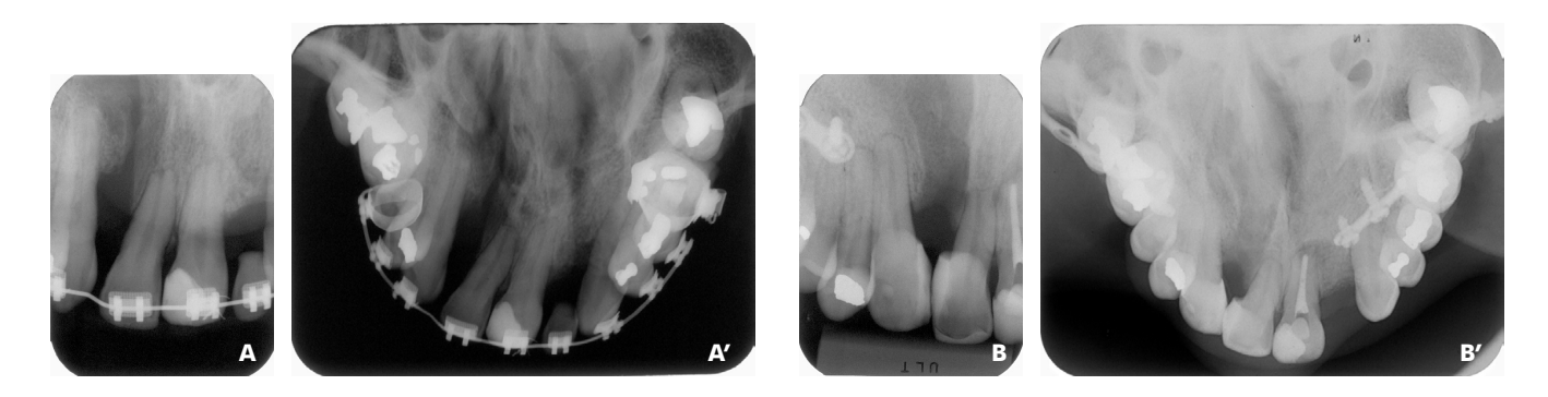
Fig. 3. Occlusal and periapical radiographs demonstrating: (A) alveolar cleft preoperatively, (B) alveolar segments of congenital lesion joined by the bone graft postoperatively.