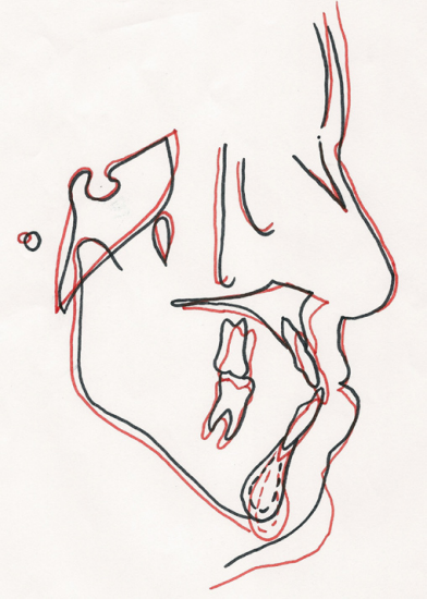
Fig. 7. Total cephalometric superimposition of initial and final cephalometric tracings with superimposition on the line SN and record on N.

Fig. 6. ( A-H ) Final facial and intraoral photographs after two years of trauma by fall. The provisional crown on the maxillary left lateral incisor was incorporated in the buccal arch of the wraparound retainer until accomplishment of the implant.