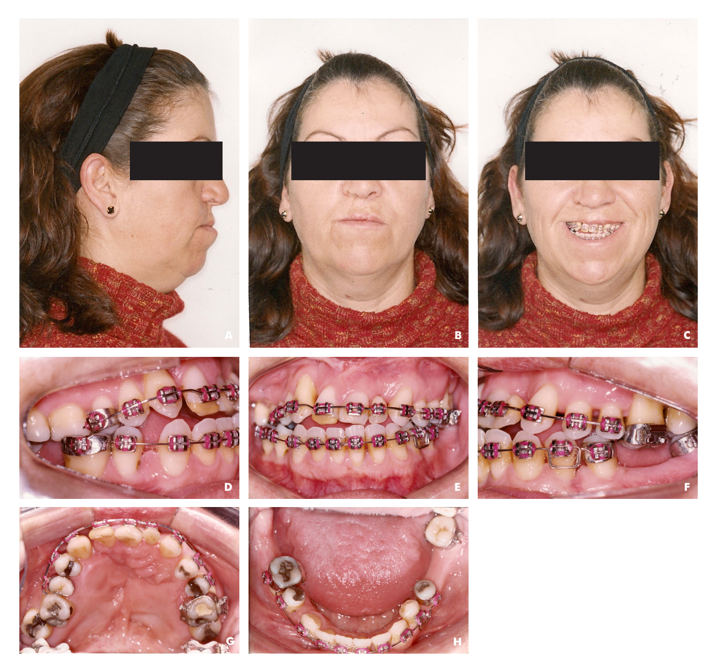
Fig. 1. (A-H) Initial facial and intraoral photographs.