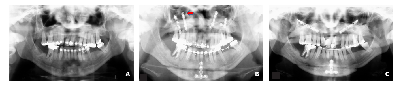
Fig. 2. Panoramic radiographs (A) initial; (B) after first surgery; (C) after second surgery and final.