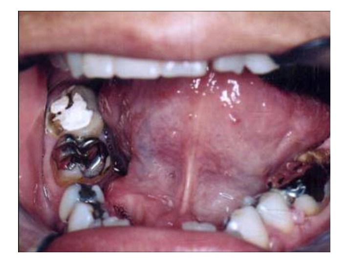
Fig. 3. There were no signs of recurrence at the 2-year follow-up.