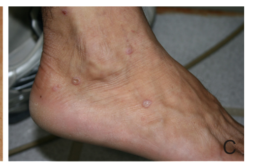
Fig. 3. Lesions in lip (A), upper eyelids (B) and inferior member (C).