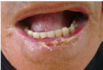
Figure 1. Clinical aspect of QA fissures, crusting, edema, and the presence of loss of the vermilion border of the lip skin.

A 73-year-old Caucasian male patient who worked as a farmer was attended at the Stomatology Clinic of the Federal University of Paraíba complaining about the presence of a “wounded lower lip”. The patient reported that the lesion had a history of about 2 years and also that in the last 15 days there had been an increase in the size of the ulcerated area including burning and discomfort in talking, smiling and eating. On physical examination, fissures, crusting, edema, presence of hair and loss limits between the skin and semimucosa were observed in the lower lip (Figure 1). Based on clinical findings and the history of chronic sun exposure, a clinical diagnosis of actinic cheilitis was made. Triamcinolone acetonide in Orabase was prescribed 3 times a day for 15 days and the patient was advised to use sunscreen and hat. After 7 days, the patient returned to the clinics for evaluation and significant clinical improvement was registered. After 15 days, there was no sign of acute inflammation (Figure 2). After 9 months under observation, the lesion was clinically stable and the patient was instructed to return every six months for evaluation (Figure 3).