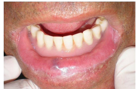
Figure 3. Clinical aspect of the AC after 9 months under observation.