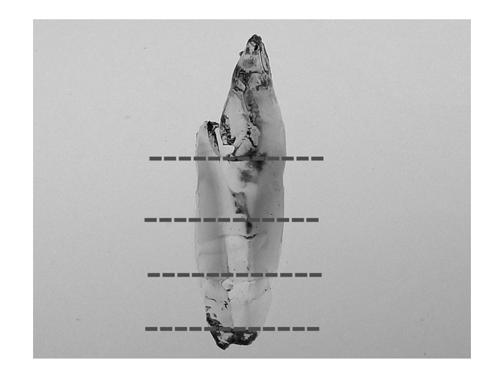
Figure 2. Group 2 (ProTaper Universal) tooth, with score 0 in the three thirds.