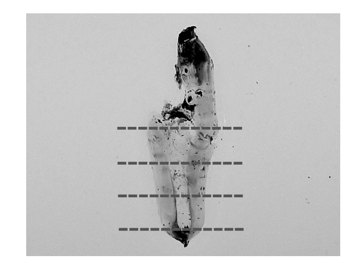
Figure 1. Group 1 (hand files) tooth, with scores 0 in the cervical third, 1 in the middle and apical thirds.

The averages of the scores obtained in each root canal third are shown in Table 1. During instrumentation there were no files fractures.