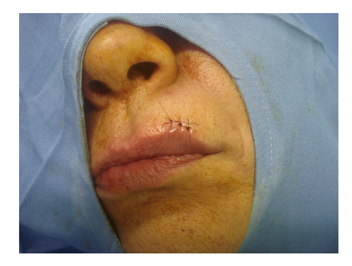
Fig. 3. Suture with 5-0 nylon.