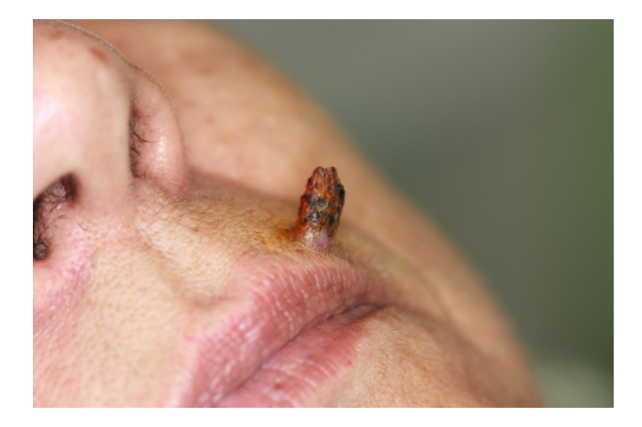
Fig. 1. Preoperative appearance of the lesion with 30 days of evolution.