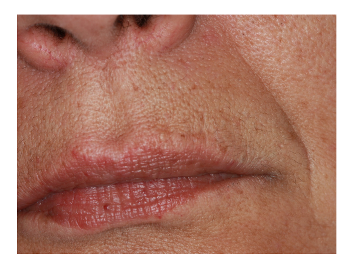
Fig. 6. Postoperative appearance of the area after 2 years.