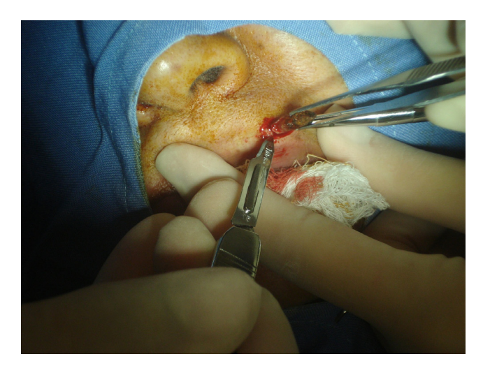
Fig. 2. Oval-shaped incision with an in-depth wedge shape for the removal of the lesion and better approximation of the lesion edges after synthesis.