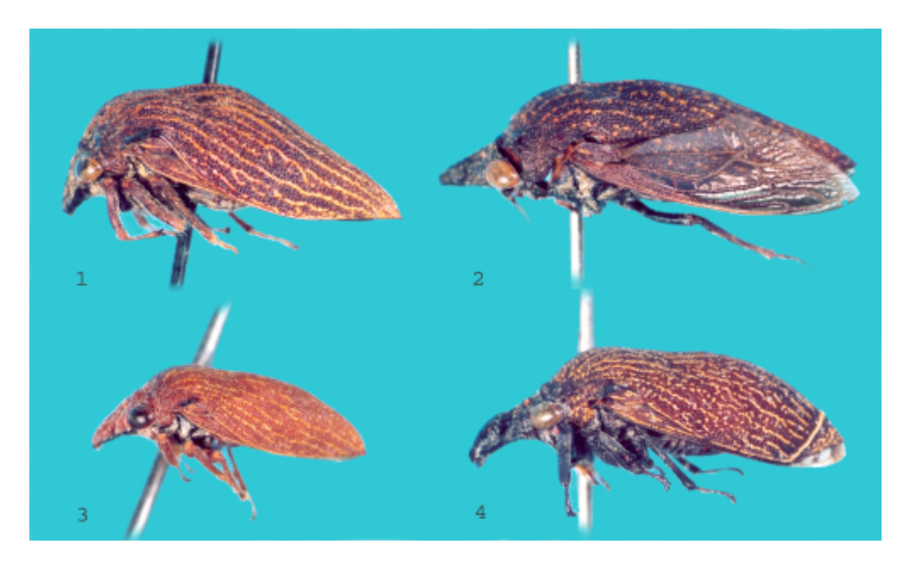
Figs. 1-4. Nasuconia gen. nov., lateral view: 1 - N. lineosa (Walker, 1862); 2 - N. catarina sp. nov. (holotype); 3 - N. nanica sp. nov. (holotype); 4 - N. curculionoida sp. nov. (holotype).