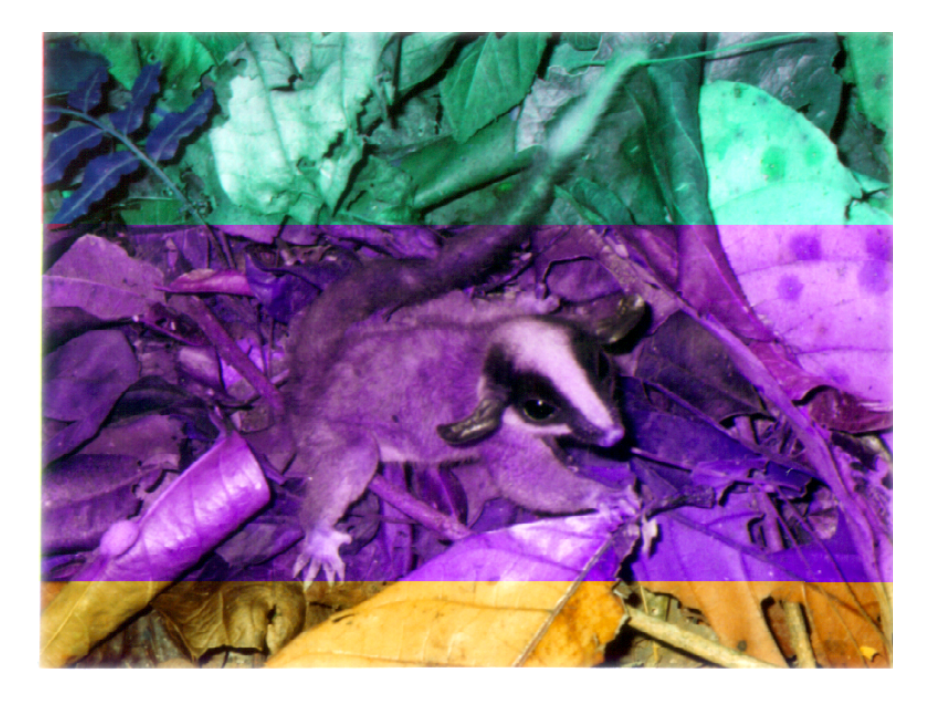
Fig. 2. Bushy-tailed opossum ( Glironia venusta ) photographed in 17 May 2001 at Espigão do Oeste, State of Rondônia, Brazil.