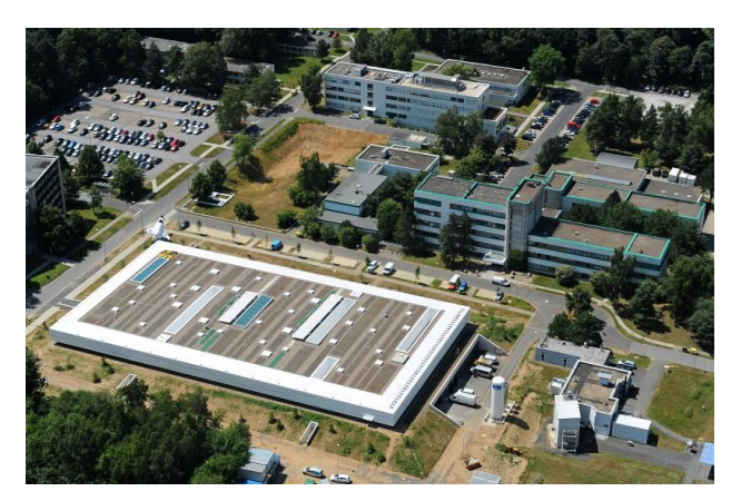
Figure 1: Location of :envihab in front of the DLR Institute of Aerospace Medicine (top right of :envihab) on DLR premises in Cologne, Germany, with six atria (blue stripes on the roof) to allow for the influx of daylight

The first concrete concepts of :envihab were presented to the public as early as 2003 (Gerzer, 2004; Gerzer, 2003). The Ground breaking ceremony took place in September 2009 and construction of :envihab began in October 2010.